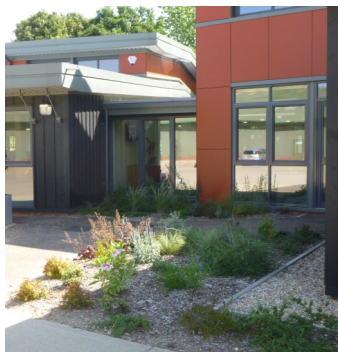
Link building between phases