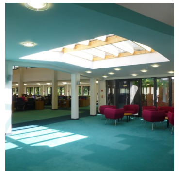
Break-out area in link building