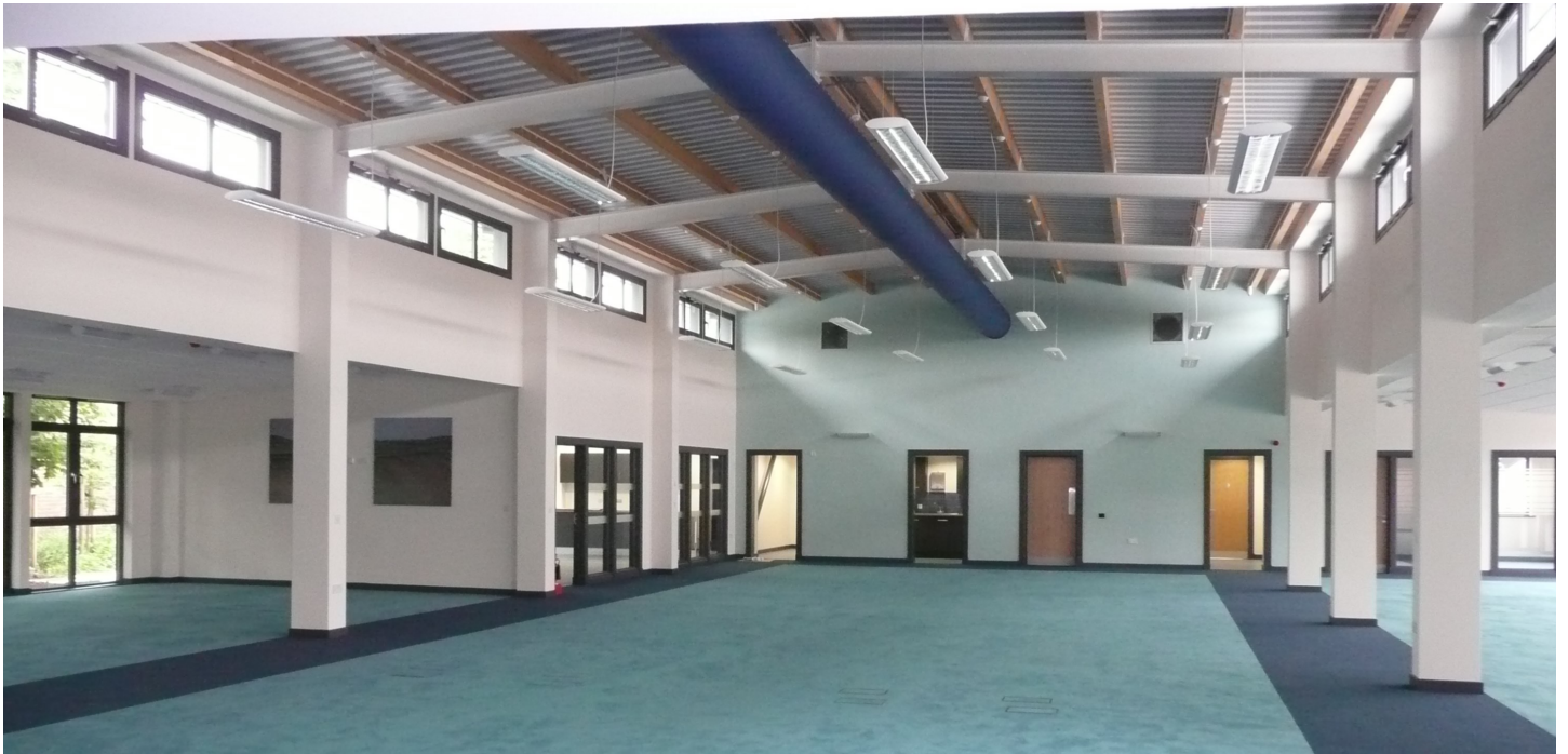
Open plan office extension