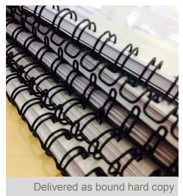
Delivered as bound hard copy