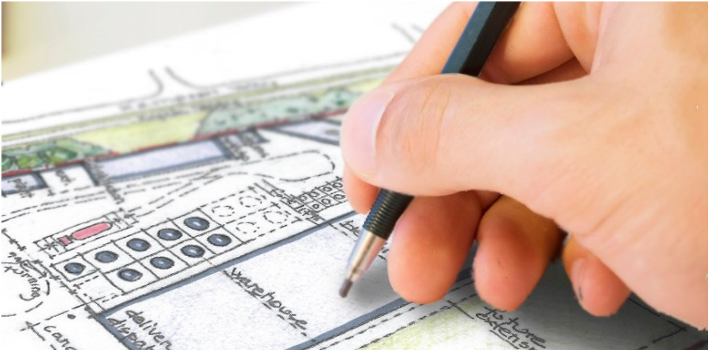
Concept layout options