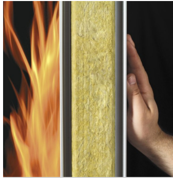
Advice on white wall panels