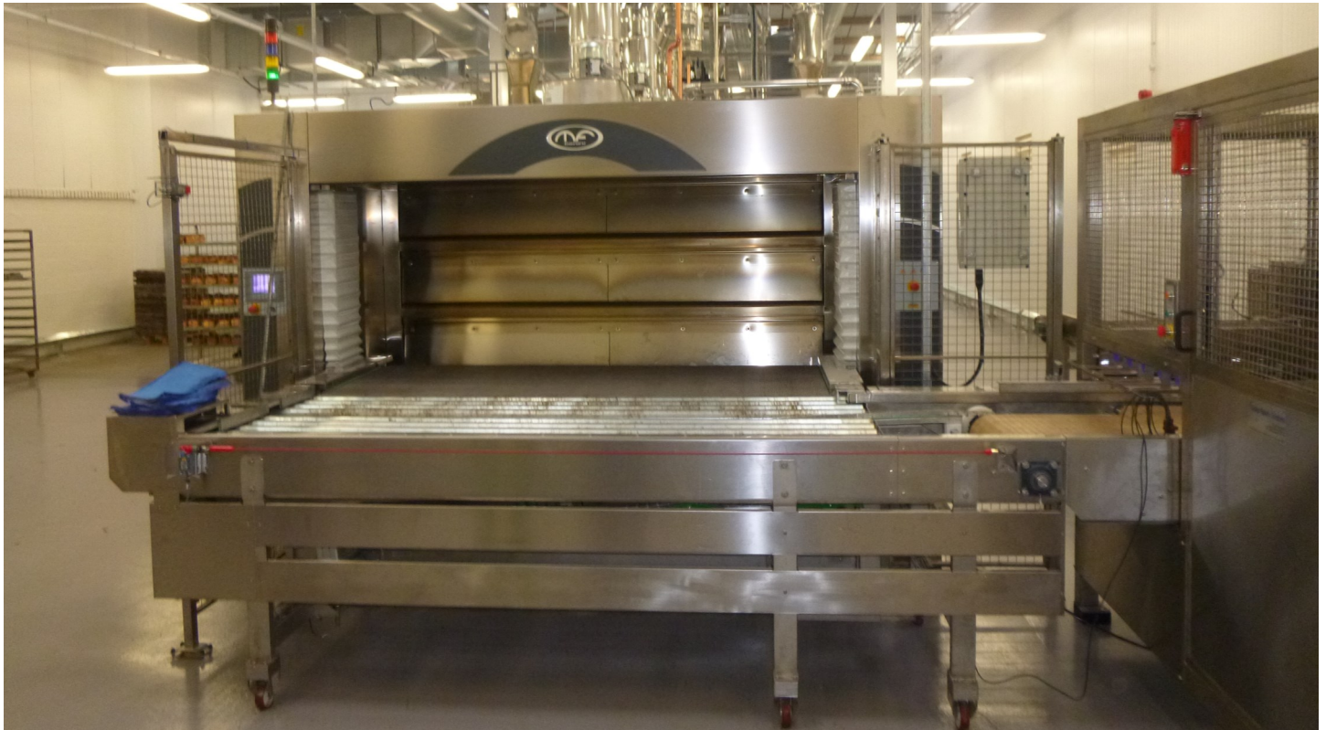
New travelling oven