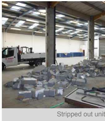
Stripped out unit