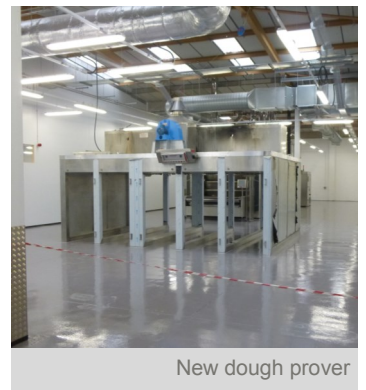
New dough prover