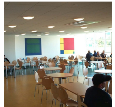
Canteen / restaurant