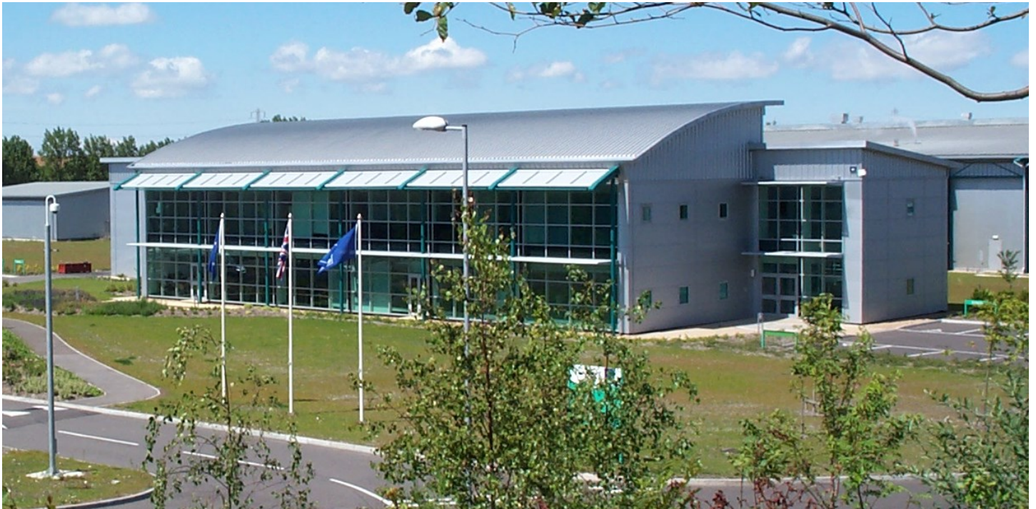
Main office building