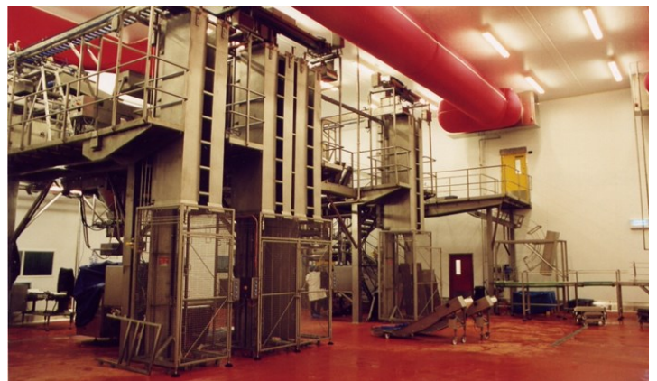
High care bagging area