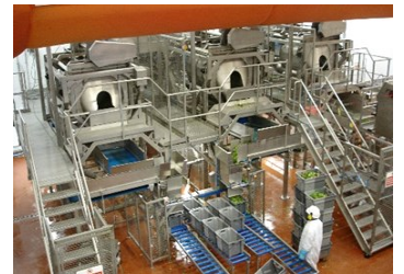
High care area