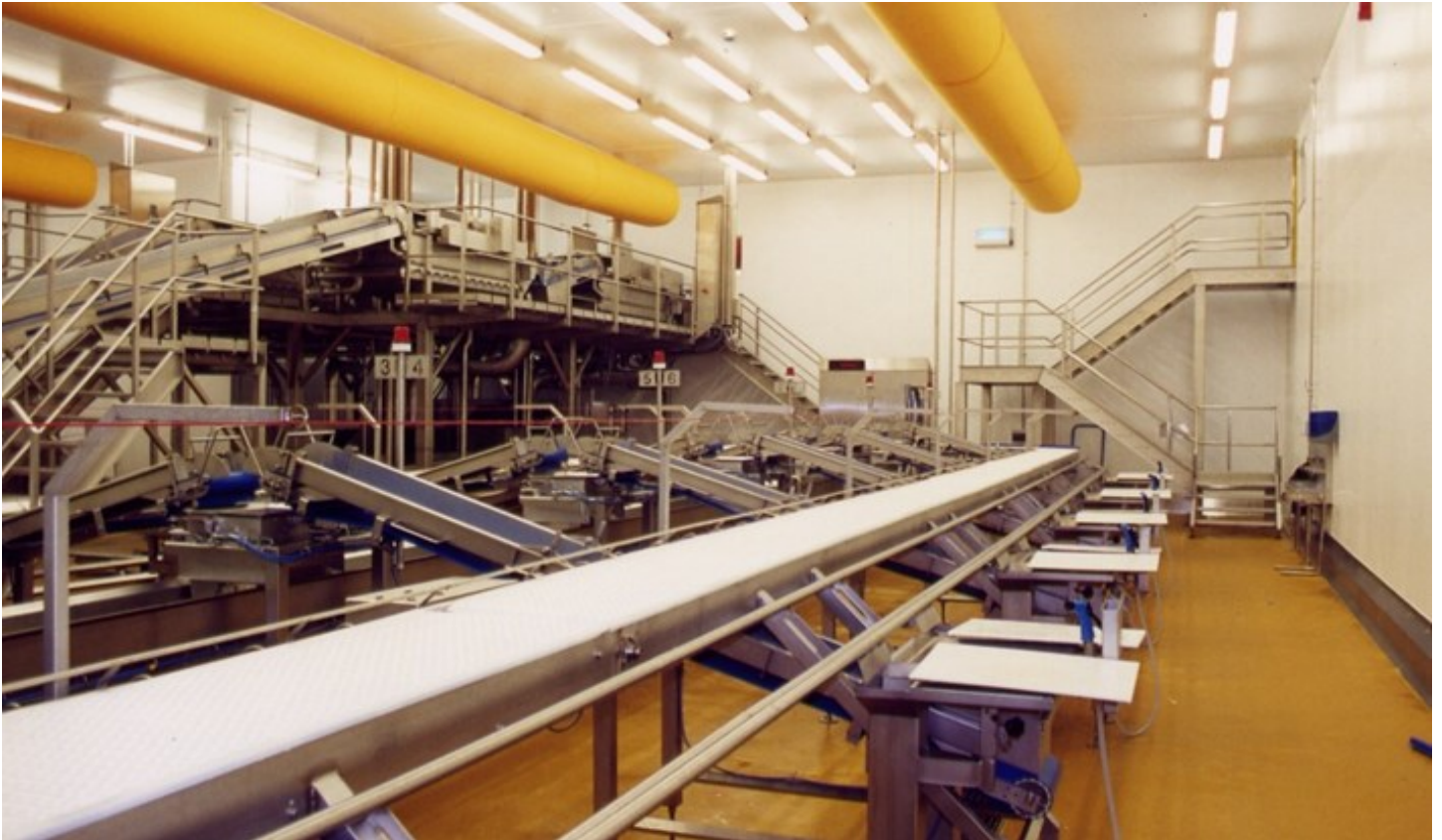
Low risk leaf preparation area